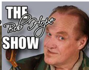
THE Bob Hope SHOW

★ Four (4) free admissions to all movies all season long (7/1/11-6/30/12)