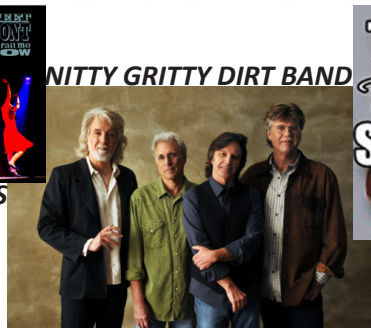
NITTY GRITTY DIRT BAND