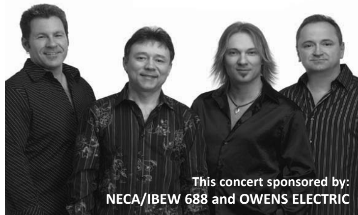
This concert sponsored by: NECA/IBEW 688 and OWENS ELECTRIC

Dinner ($15) is available in the May Pavilion beginning at 6:00 p.m. Catering by The Warehouse. Menu includes: Tomato Basil Soup, Caesar & Italian Salads, Chef Carved Roast Beef, Pasta w/ Sun-dried Tomato Pesto, Red Skin Potatoes, Green Beans, Bread, Assorted Desserts, Iced Tea & Lemonade. Reservations at 740/383-2101.